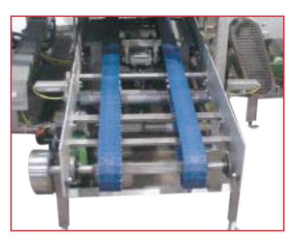
Empty Basket Infeed